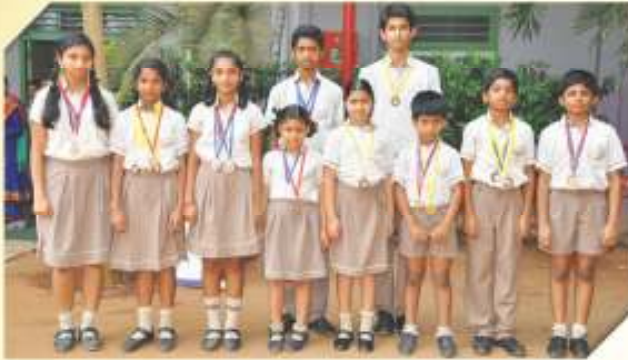
East Godavari Roller Skating Championship held at Kakirada on 1st and 2nd November, 2013.