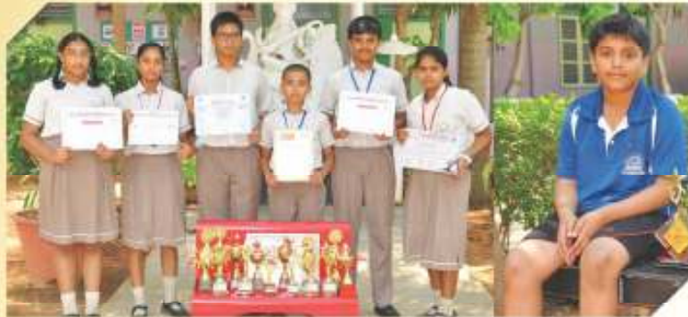
June 28th, 29th & 30th new Wave Shuttle Championship - 2014, District Level tournament at Rajahmundry